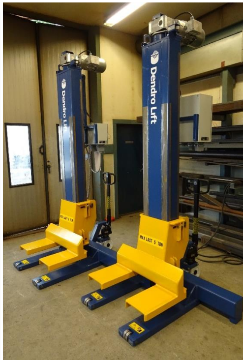
DendroLB3T – Made in Sweden